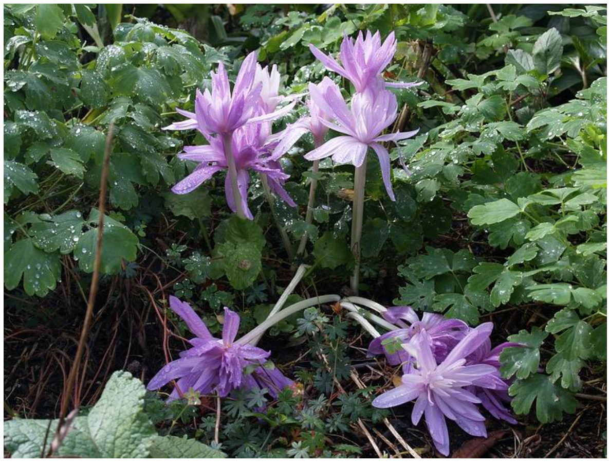
Colchicum 'Water Lily'

Colchicum 'Water Lily' is not my favourite- in fact I am not sure if I like it or not- its one saving grace for me is that even when the flowers are toppled by the weather they still manages to hold themselves open. Above they are in a bed with spring bulbs that flower very early before the colchicum leaves get going, then various other plants like Aquilegia provide summer interest.