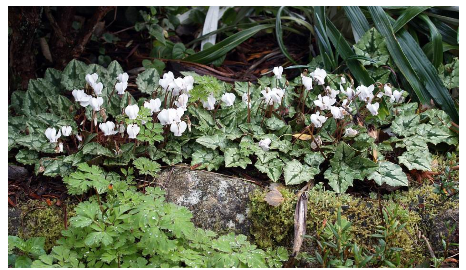
Cyclamen hederifolium album

This is a group of Cyclamen hederifolium seedlings from the silver leaf group and they are especially useful to light up the more shaded areas. In a month's time most of the leaves will be off the trees and the cyclamen will then receive the full power of our subdued winter light.