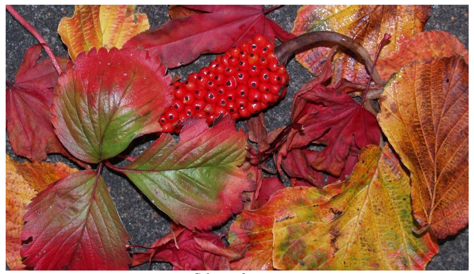
Colours of autumn

While not wanting to admit to having 'white fever' or indeed to be whipping it up I do have the first Galanthus in flower just now. I do not find Gallanthus regine olgae to be that hardy in our garden as most of the ones I have planted over the years quickly die out so I have taken to keeping a few in pots in the bulb house where we can enjoy their early beauty.