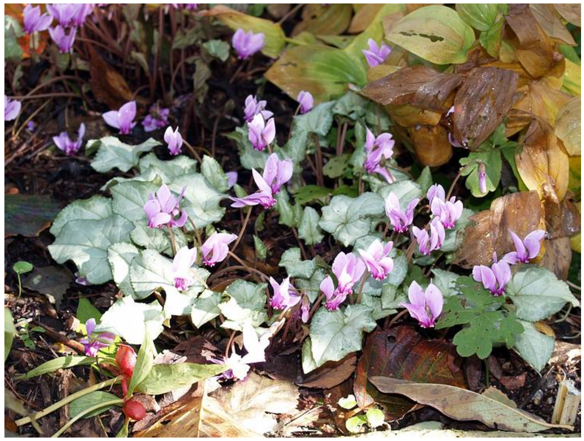
Cyclamen hederifolium silver leaf

This is a group of Cyclamen hederifolium seedlings from the silver leaf group and they are especially useful to light up the more shaded areas. In a month's time most of the leaves will be off the trees and the cyclamen will then receive the full power of our subdued winter light.