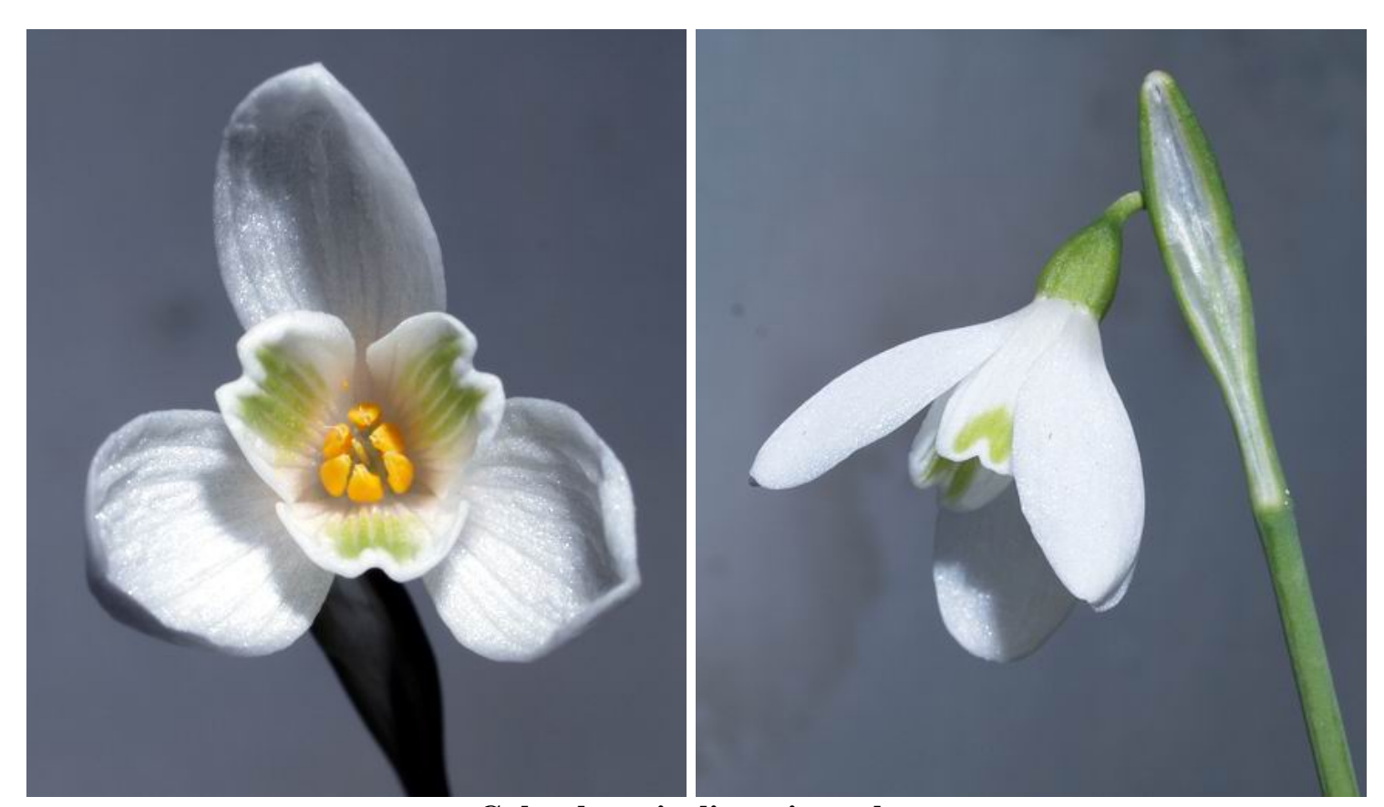
Galanthus nivalis reginae olgae

While not wanting to admit to having 'white fever' or indeed to be whipping it up I do have the first Galanthus in flower just now. I do not find Gallanthus regine olgae to be that hardy in our garden as most of the ones I have planted over the years quickly die out so I have taken to keeping a few in pots in the bulb house where we can enjoy their early beauty.